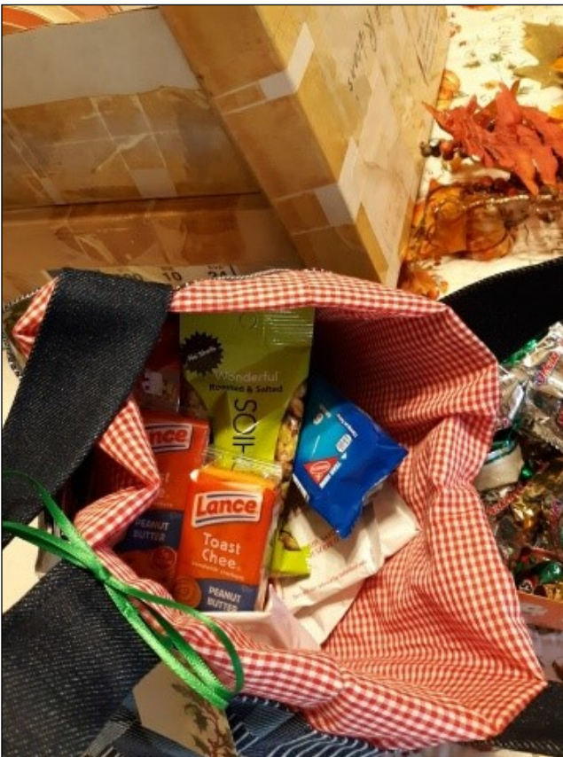
Care package from Marshall Music Club