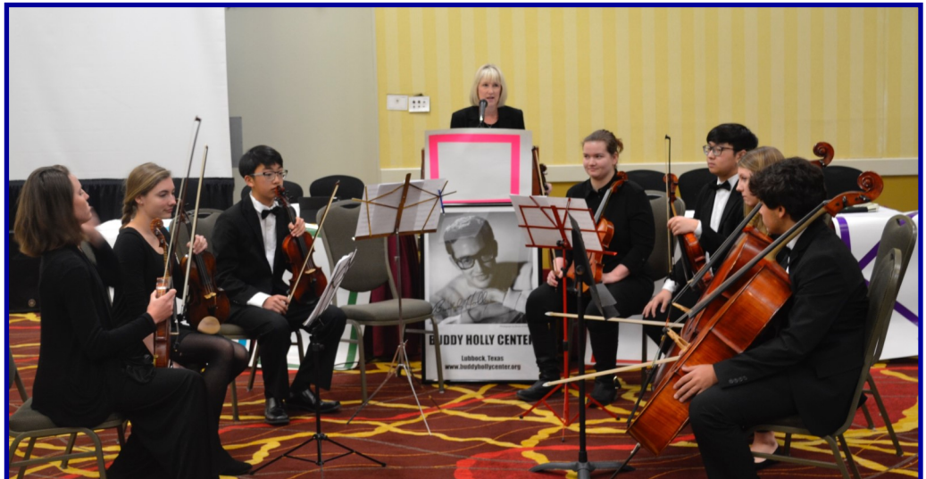
An ensemble from the Lubbock Youth Orchestra performs for the convention.